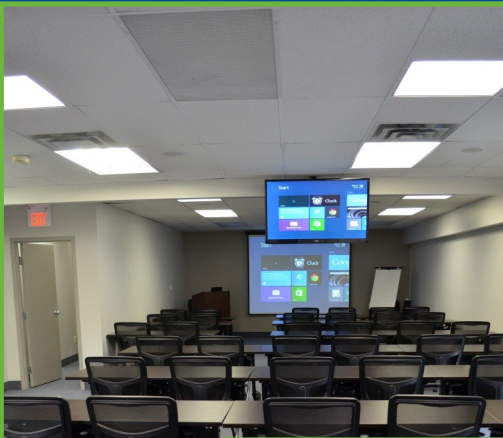
Oakville Classroom (View of Front)